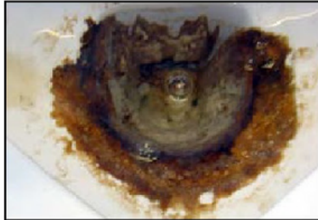
AFTER 45 DAYS OF BLAST OUT USE