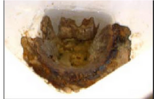
AFTER 60 DAYS OF BLAST OUT USE