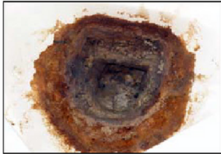
BEFORE BLAST OUT