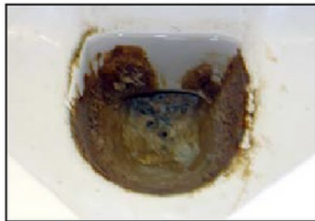
AFTER 90 DAYS OF BLAST OUT USE