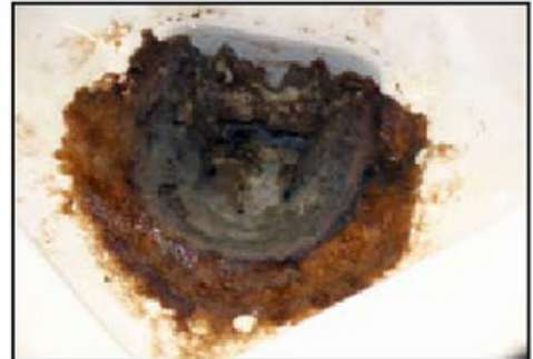
AFTER 30 DAYS OF BLAST OUT USE