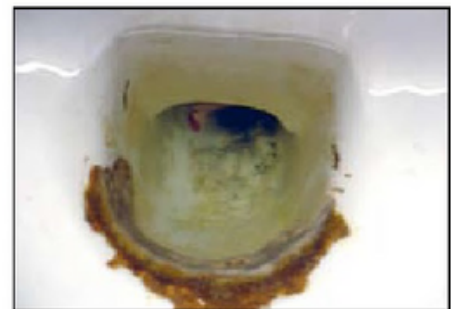
AFTER 6 MONTHS OF BLAST OUT USE